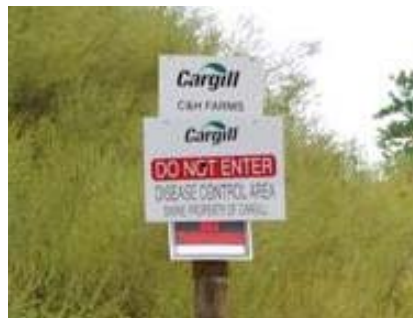
Photograph of Sign at C&H

C&H is contracted with Cargill, one of the world's largest privately-owned businesses, which had sales and other revenues of $136.7 billion in fiscal year 2013 alone. 4 Despite this, C&H put taxpayers on the line for $3.4 million in federal loan guarantees in order to obtain a loan for construction. 5